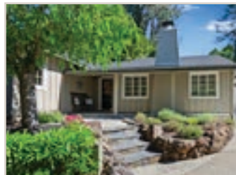
237 Rheem Blvd, Moraga

Quietly tucked, charming, Traditional Farm House nestled in the hills overlooking Reliez Valley to Las Trampas.