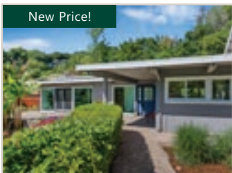
14 Washington Ln, Orinda

Orinda hillside sensation in the El Toyonal neighborhood showcases awe-inspiring panoramic views as far as the Carquinez Straits.