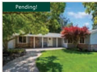
90 Meadow View Rd, Orinda

Newly renovated 4bd/ 2.5ba mid-century home in the heart of desirable Sleepy Hollow fits an open floor plan w/ a flat yard & pool!