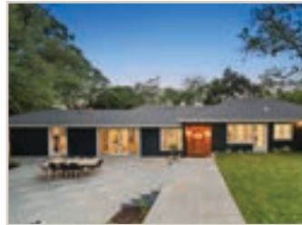
20 El Patio, Orinda

Experience luxury living in this captivating 1971 modern architecture masterpiece, designed by Bud Evenson & stylishly remodeled in 2015!