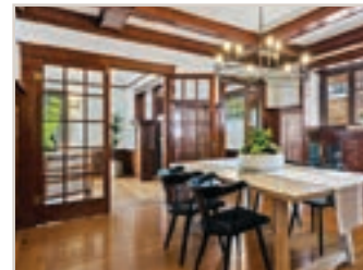
5505 Taft Avenue, Oakland

Located in the heart of desirable Moraga, this beautiful, all-level home offers contemporary style & designer detailing.