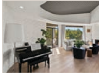
523 Miner Rd, Orinda

Magically set in an heirloom garden is this stunning, private, one of a kind Classic Orinda Country Club home!