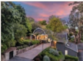
1603 Reliez Valley Rd, Lafayette

Charming, private retreat nestled in the Lafayette hills - only a short distance to hiking trails, Los Trampas swim club, & local shopping!