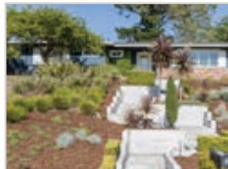
131 Devin Drive, Moraga

Set up a private driveway, this expanded single story home combines a super floor plan w/ high quality updates & relaxing outdoor spaces.