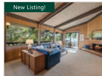
7 La Campana Rd, Orinda

A custom-built 3+ bd/3.5 ba sanctuary nestled amongst redwoods & oaks offering the perfect blend of luxury & tranquility.