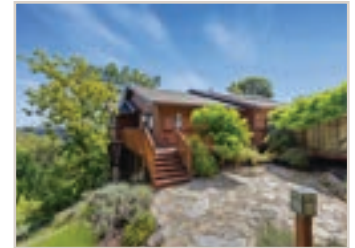
19 Las Piedras, Orinda

This Sleepy hollow gem features 4 bd + office/ 3.5 ba on a rare, flat lot w/ a beautiful view!