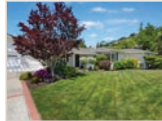
66 Van Ripper Ln, Orinda

Totally renovated & updated in 2013, this light filled 6 bd/ 4.5 ba w/ bonus room & possible au-pair suite is a fabulous place to call home.