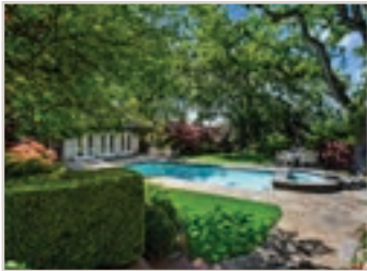
33 La Noria, Orinda

5 Bd + Office | 4.5 Ba | 5267 Sqft | $5,500,000