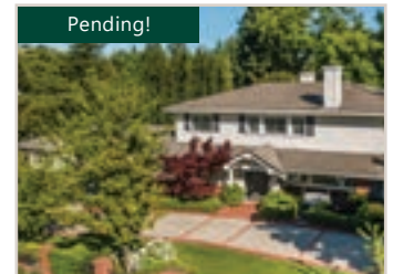
101 La Serena Ave, Alamo

Single level bungalow, fully upgraded systems & design, most sought after block in Rockridge!